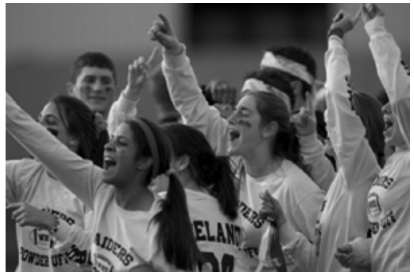
The Senior Powder Puff team enthusiastically celebrates another victory.